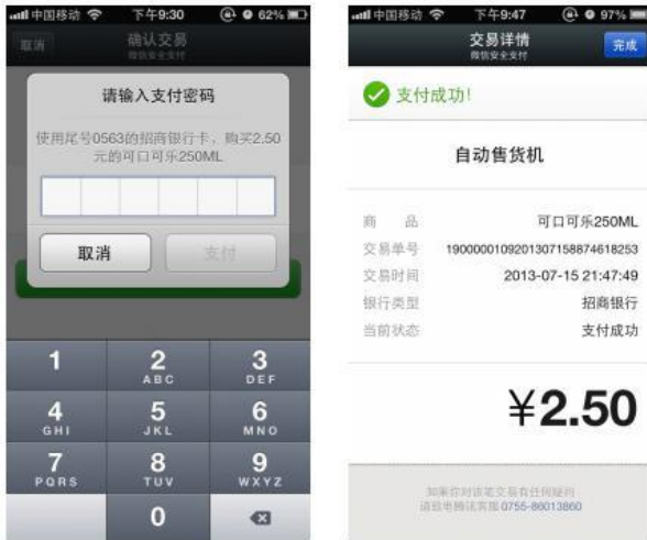
Figure 4 Step 4: Merchant system receives payment result after payment is completed and delivering goods.